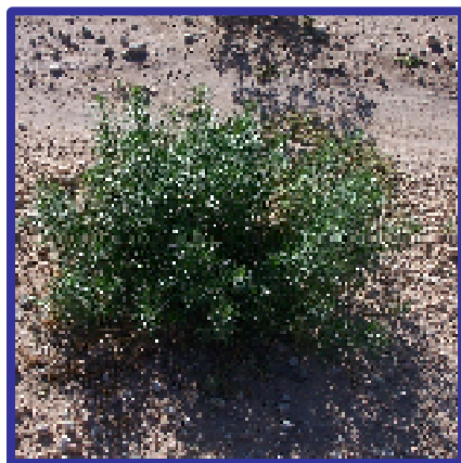
African Rue Near Willow Lake

At present, three species are being targeted by the Eddy County CWMA. They are African Rue, Malta Star-thistle, and Russian knapweed.