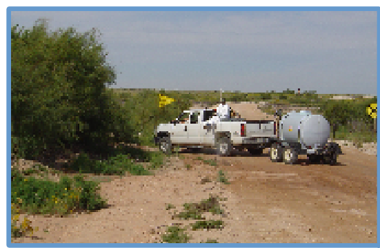
Treatment of salt cedar by Eddy County CWMA.

The intent of the program is to prevent introduction, control the spread of, and eradicate noxious plants through the coordinated efforts in Eddy County. Noxious plants are defined as exotic or alien plants that interfere with the management objectives for a given area of land at a given point in time.