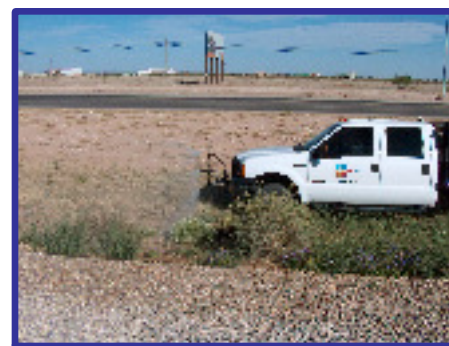
NM Dep't of Transportation treating noxious weed in a right-of-way

The lower leaves ranges from entire to lobed and upper leaves are small entire and directly attached to the stems.