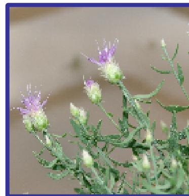
Russian Knapweed Flower Closeup

Russian Knapweed - (Acroptilon repens L.) is a creeping perennial weed that spreads mostly by root buds but also by seed with growth characteristics similar to Canada thistle. Russian knapweed can be distinguished from other knapweeds by the pointed papery tips of the floral bracts. It also has dark brown or black, scaly roots that can reach depths over 20 feet. The plant can reach 4 feet high and has flowers that range in color from light pink to lavender. The lower leaves ranges from entire to lobed and upper leaves are small entire and directly attached to the stems.