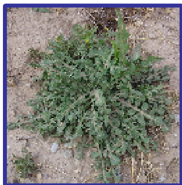
Malta Star-thistle in Rosette Stage

originated in the deserts of North Africa and Asia. The plant grows approximately 1.5 feet high with leaves that are alternate, smooth and divided in linear segments. The flowers have five petals and grow singly in the leaf forks of the stem.